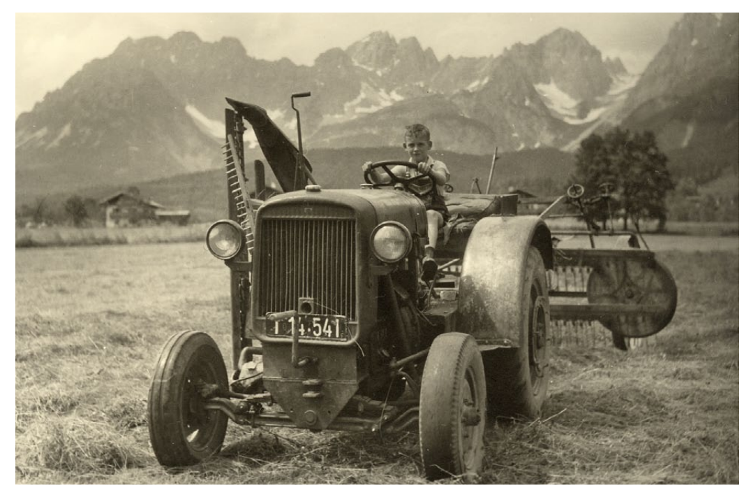
The young Balthasar learnt the farming trade from the bottom up.