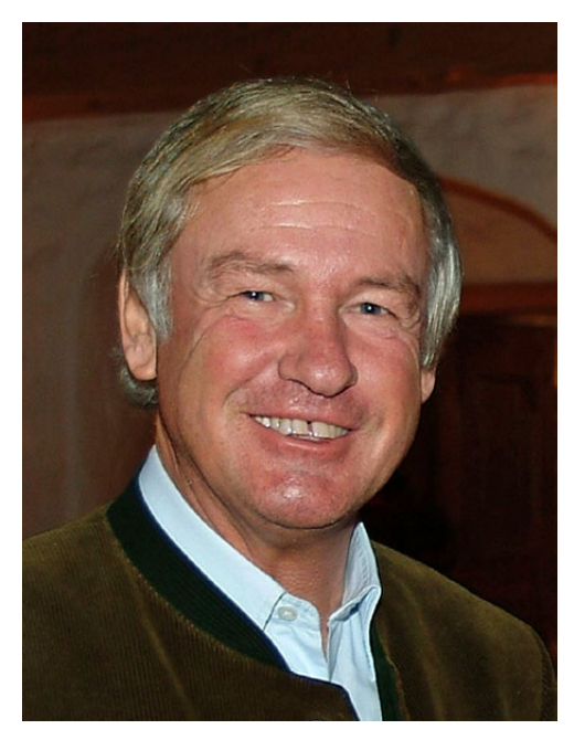
Not proud but satisfied...