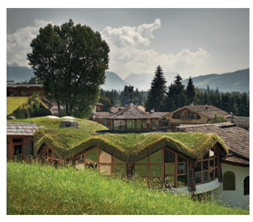
For environmental reasons, all the roofs at the Stanglwirt are made of grass or shingles.

And the tree bark heating system: at first it enveloped the whole of the village in a cloud of smoke, which caused uproar amongst the locals. The bark waste that was being burnt was far too wet and the system was not properly adjusted. It took three weeks for an engineer to come from the manufacturer in Sweden and solve the problem. So during Carnival, some of