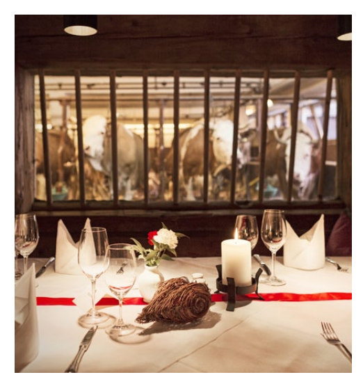
Farming is part of the identity of the Stanglwirt and still plays an important role today.

Suddenly the Stanglwirt became famous far and wide as the inn with the cowshed window in the dining room. Nowhere else could guests watch the cows during their meal - and vice versa. It came about completely by chance. When the dining room