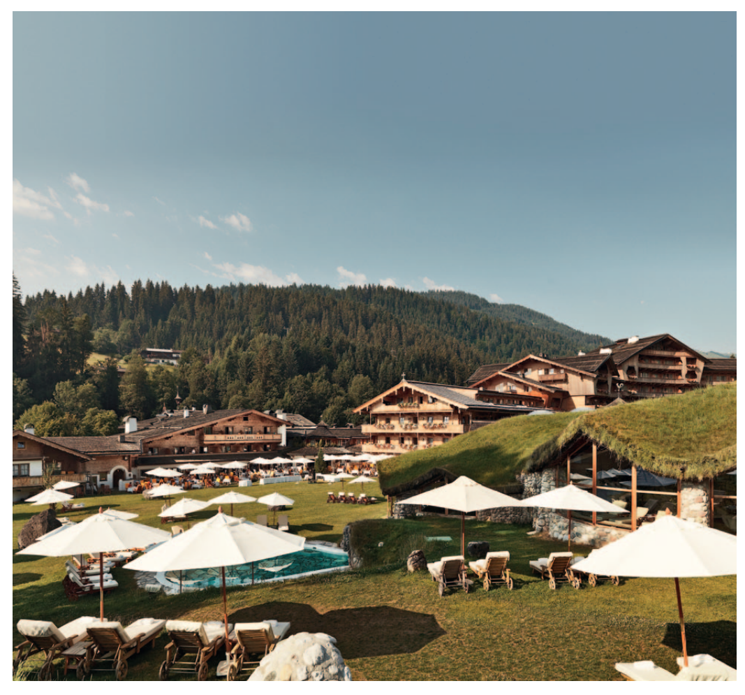
Today, the Stanglwirt is virtually a complete village, with an inn, restaurant, eco-hotel, wellness and sports facilities, riding arena, tennis hall, stables, barns and many other buildings and amenities.