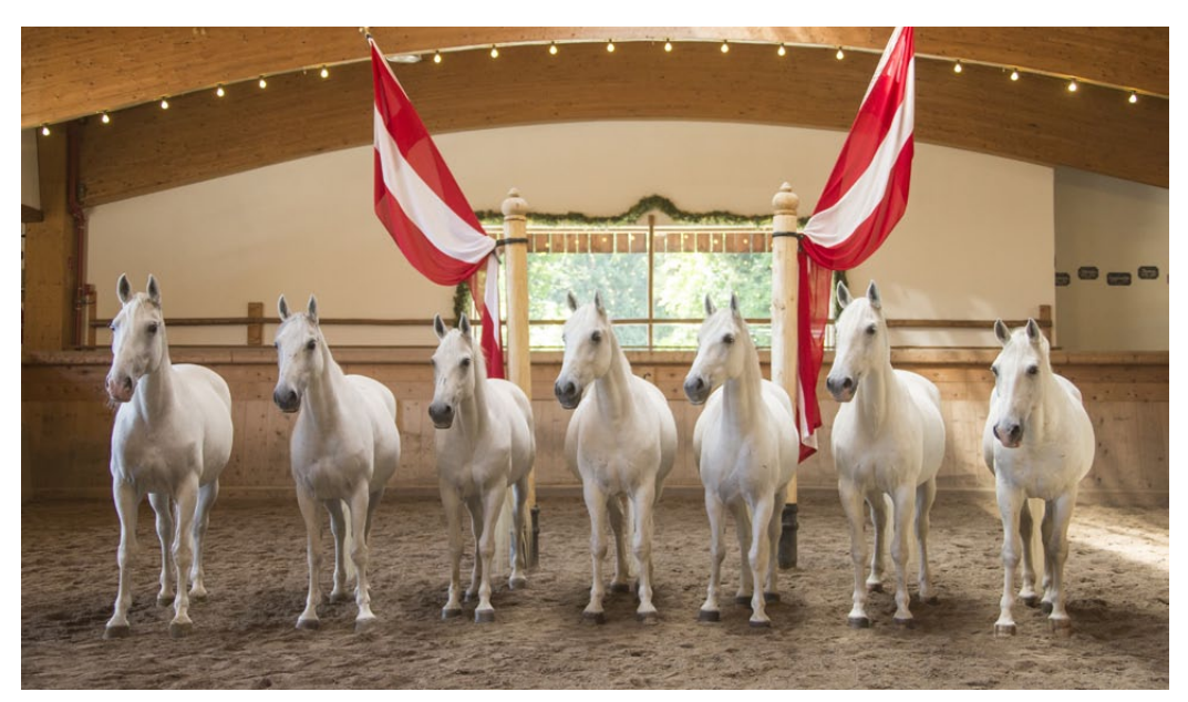
The Stanglwirt has the biggest private Lipizzaner breeding programme in Austria.