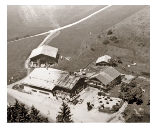
In the 1950s, the old miners' tavern had to make way for the main road. With the old wood, a new dining room was built at the Stanglwirt.

should remain at the Stanglwirt. She wanted to avoid the name "Schlechter Stanglwirt", which would have meant "bad host".