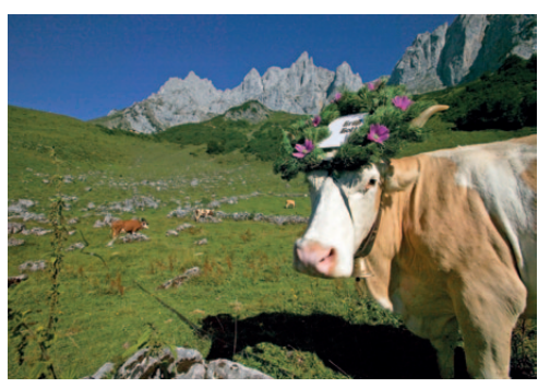
As for all alpine farmers, bringing down the cows is a special event at the Stanglwirt, too.

Stanglwirt like the mountains belong in the Tyrol." Never, not even during periods of innovation and expansion, did he think of changing the agricultural infrastructure. "If I could tell my ancestors about the way we farm at the Stanglwirt, they would not notice many changes. Essentially, we still do it in the same way as 100 years ago," says the farmer, referring to his horned cattle, the way they go up to the alpine pasture in the summer and the fact that they are fed only on hay. What makes the Stanglwirt different from many other hotels which have farms is that here the cowshed and barn are not at a distance from the hotel.