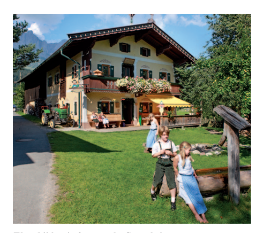
The children's farm at the Stanglwirt.

At the Stanglwirt there is also a second farming enterprise in miniature: the children's farm. A small farmhouse just next door has been leased and set up for children. Guests' children can experience the exciting world of the children's farm free of charge and find out about farming with expert supervisors and instructors, and real sheep, ponies, rabbits, chickens and cats.