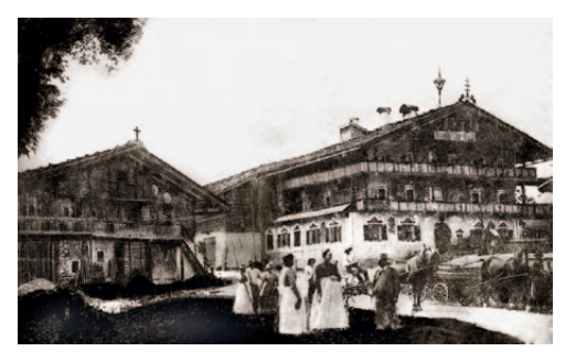
The new Stanglwirt was built in 1720 alongside the old "Inn on the Prama" (on the left).

In 1714, the hotel came into the ownership of the Schlechter family, under whom a golden era began. As a result of the trade in salt, cheese, iron and wine, the Stanglwirt became no longer just an inn but the hub of a trading network that extended far into the neighbouring countries. In 1720 the new inn was built, which has been preserved to this day in its original form. The family bought numerous plots of land, mainly from miners who left the region as the