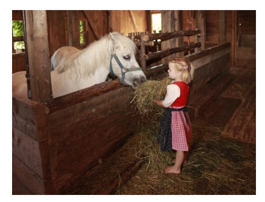
The children love meeting the animals.