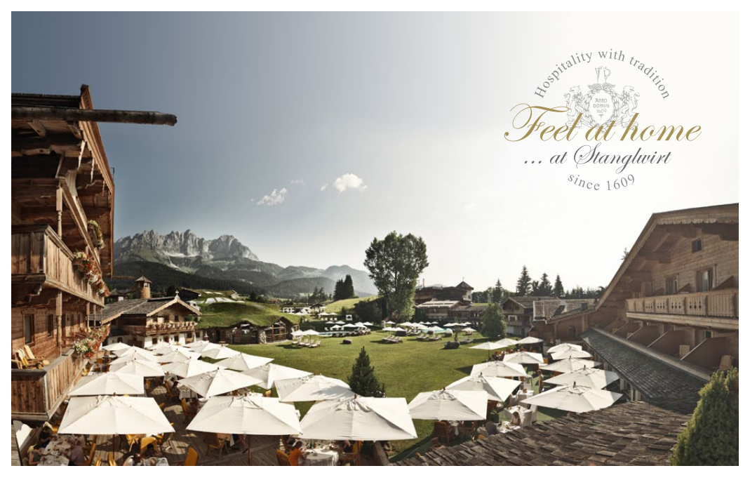
Nature and luxury, health and enjoyment, tradition and innovation, homely yet cosmopolitan: at the Stanglwirt, there are no contrasts, just harmonious interaction – the secret of its success.